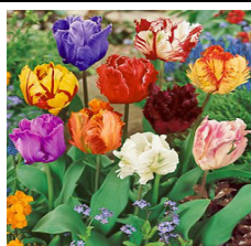
Parrot Tulip Mix