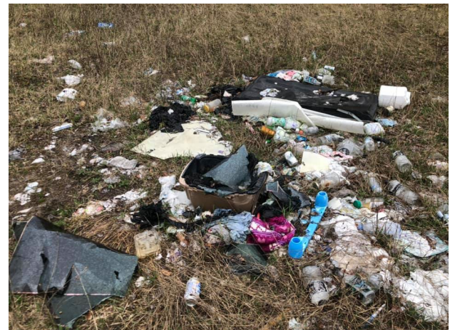
1 West Branch Maple River showing boulders and litter/debris