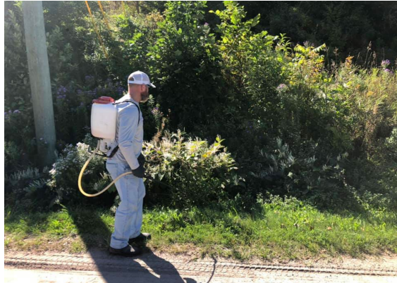
2 Invasive Knotweed mapping and herbicide treatment